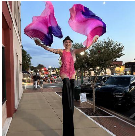
A stilt walker thrilled crowds at the September ArtWalk.